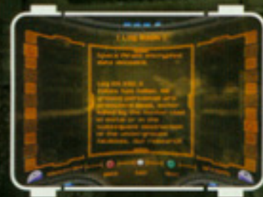
Log Book Entry

As you play through the game, be sure to scan anything and everything. Very often you'll learn a crucial bit of information by scanning an enemy or downloading one of the many research logs located around the Space Pirates' operation. To view information that you have downloaded to your Log Book, press START/PAUSE and access the Log Book by pressing the R Button. From there, select the data you want to view and press the A Button to access your databanks.