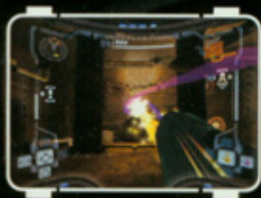
Super Missile Combo

Every beam weapon can be combined with Missiles to perform a super combo once Samus has found that beam weapon's combo power-up. To use a combo, charge up your beam weapon all the way by pressing and holding the A Button. Then, without releasing the A Button, press the Y Button. Bear in mind that combos drain your Missile reserves. Some obstructions can be destroyed only by specific combo attacks.