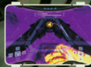
Searching for Clues