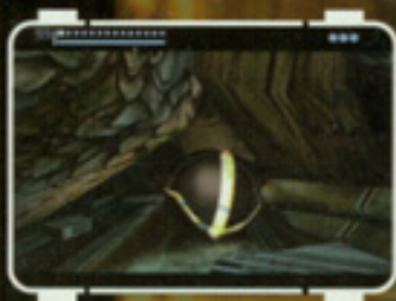
Morph Ball Mode

By positioning the Morph Ball directly over a Bomb, you can propel the Morph Ball up into the air, effectively jumping short distances. Try varying the timing as you drop Bombs to reach even greater heights.