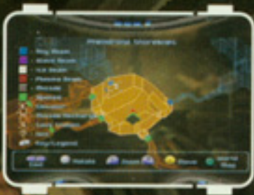
Reading the Map