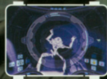
Tracking the Invisible